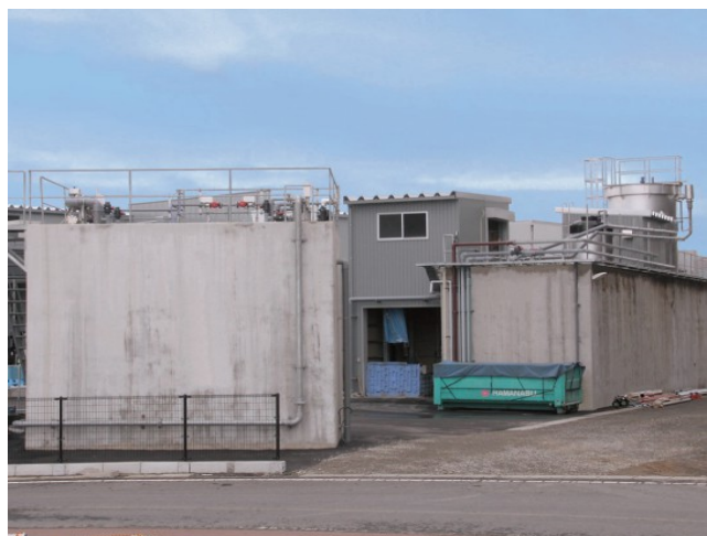
Overview of Treatment Facility Left : Membrane Tank Right : Existing Tank