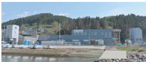
Overview of Factory

Our customer was struck by the disaster of the Great East Japan Earthquake in 2011. At that time, they quickly started working as one for factory's revival. Then they resumed production 5 months later, and completed the new factory next May. KUBOTA Submerged Membrane Unit® has shown good and stable performance along revival plan.